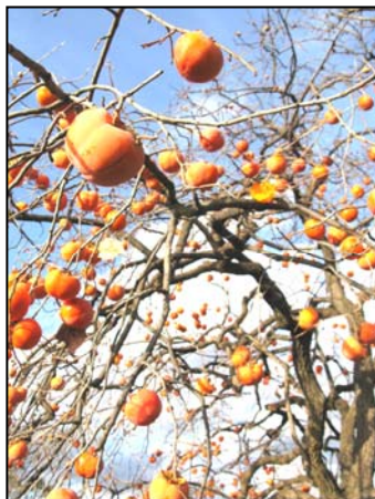
Our persimmon tree in early winter

After all the rain in late January, it looked like we would have big botrytis problems. However the gods