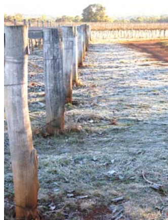
Morning after another -5degC frost

In the case of the reds, probably our best vintage yet with nice warm days & cool nights giving near perfect fruit with elevated acids & low to moderate pH levels; just what the winemaker ordered for making cool climate wines of character & finesse!