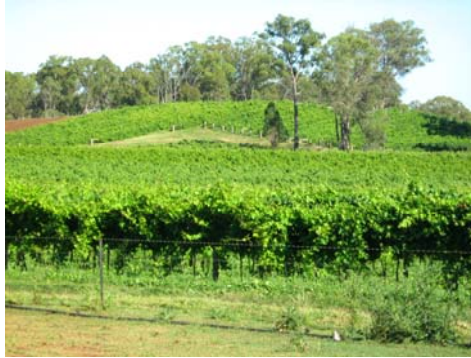
Topper's Mountain Vineyard in late January

Our '07 topper's Mountain Tempranillo, '06 Vintage Fortified Touriga and our '07 thunderbolt's "Combo" Dry Red are our latest offerings, having been released in mid-February.