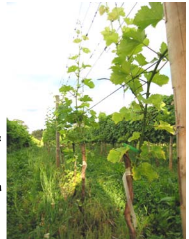
Vines grafted in Oct last year loving the wet conditions (Sauv Blanc grafted on to Verdelho rootstock).

One small upside of the wet year is that the grafted vines are doing fantastically well, as the picture below shows!